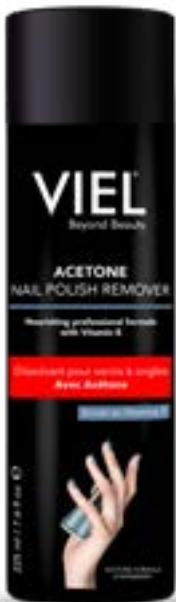
V - 353 Strawberry | pink 225ml

Nourishing professional formula with Vitamin E