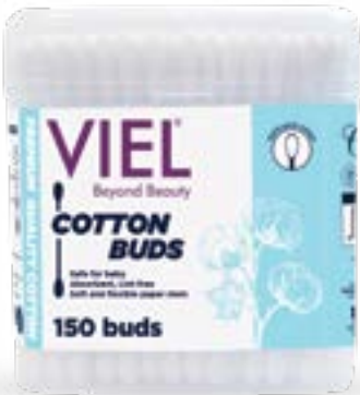
V - 360 150 buds