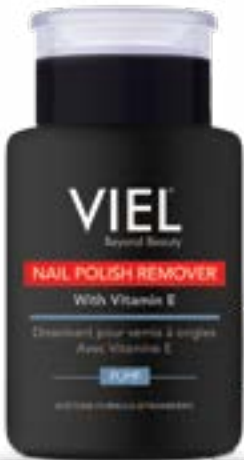
V - 351 Strawberry | Pink 175ml