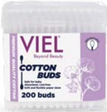
V - 361 200 buds