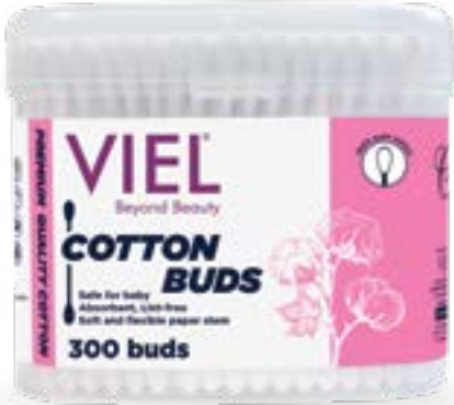
V - 362 300 buds