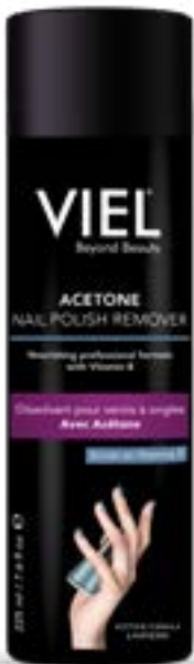
V - 354 Lavender | purple 225ml