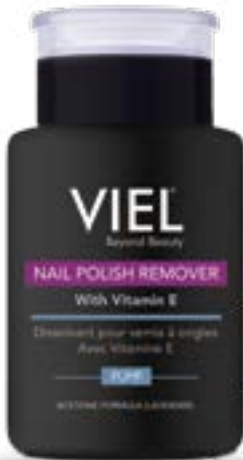
V - 352 Lavender | Purple 175ml